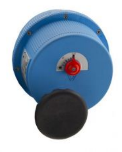
Section Valve Motor Actuator