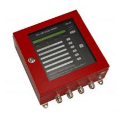
CO2 Release Panel CP-30