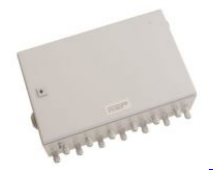
Module Cabinet MC-308