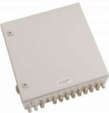
Module Cabinet MC-312