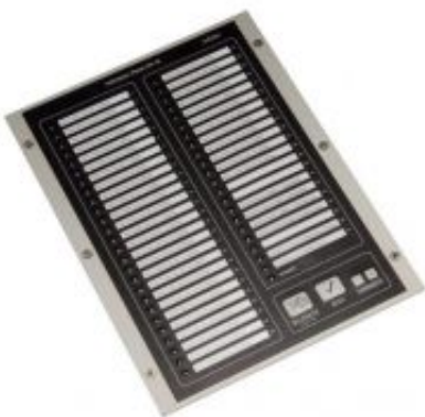
Indication Panel CP-10