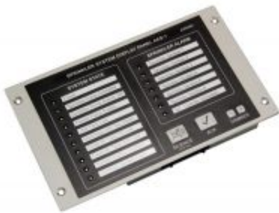
Sprinkler Alarm Display Panel CP-410