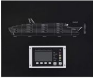
Sprinkler Alarm Mimic Panel CP-488