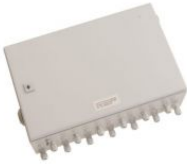
Module Cabinet MC-308