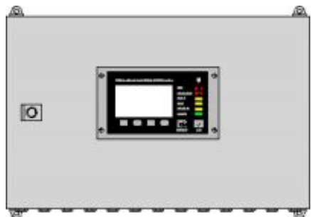
CP-100 in Module Cabinet MC-308