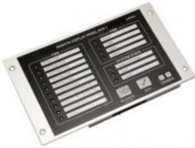
Remote Display Panel for ACS-1-FD